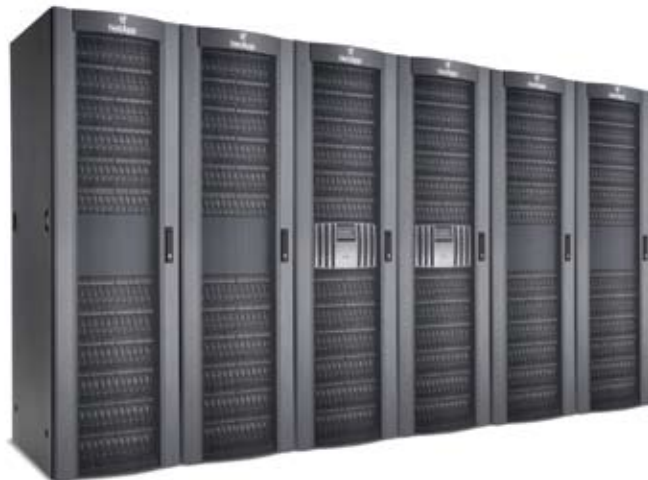
Figure 1) FAS6070 system.

Another Data ONTAP 7G feature, FlexClone®, instantaneously creates cloned LUNs or volumes without requiring additional storage. FlexClone can dramatically improve the effectiveness and productivity of application and database development and predeployment testing.