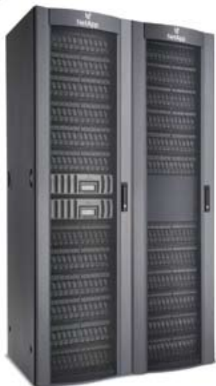
Figure 3) FAS3040 system.

The FAS2020 squeezes 3.6TB into a 2U enclosure with optional external expansion for an additional 21TB of capacity. The FAS2050 scales to 69TB and 104 disk drives. Whether for primary or secondary storage use, the FAS2000 series offers